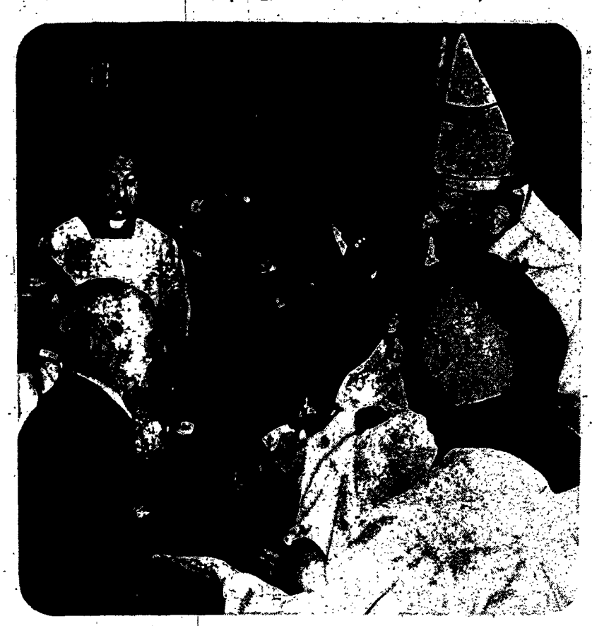
Pope Paul at beatification ceremony.