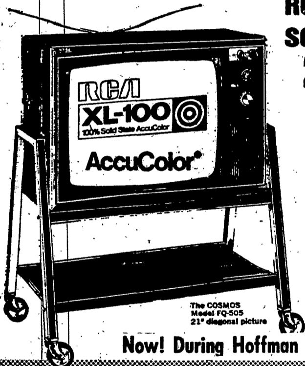
The COSMOS Model FQ-505 21" diagonal picture Now! During Hoffman RCA Week!

RCA 100% SOLID STATE 21 Inch Solid State