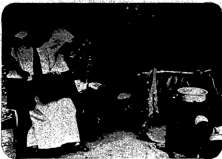
A missionary sister looks to the health of the destitute.