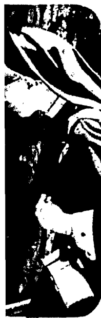
erves to heal, give the help- o be loved.