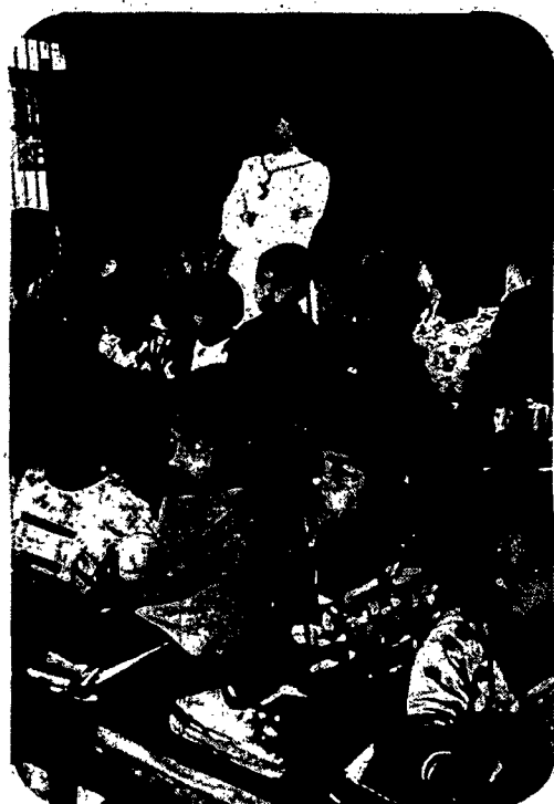
Hunger for education is no less real than hunger for food.