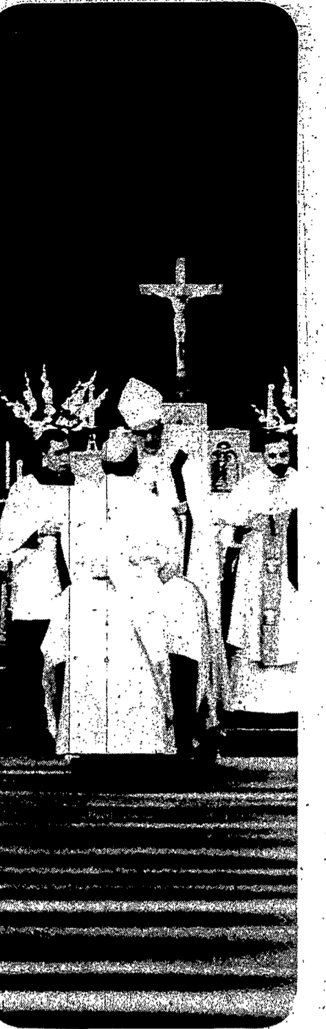
A BISHOP IS A PRIEST: above, his daily morning Mass; right, a funeral Mass; and below, a concelebrated Mass with the St. Bernard's graduates.