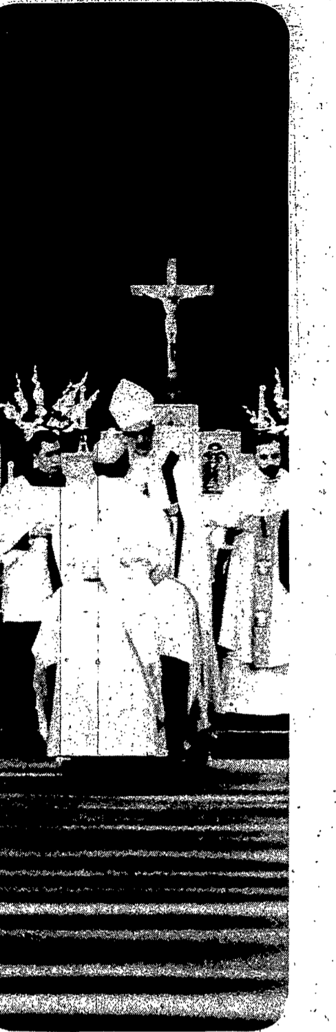
A BISHOP IS A PRIEST: above, his daily morning Mass; right, a funeral Mass; and below, a concelebrated Mass with the St. Bernard's graduates.