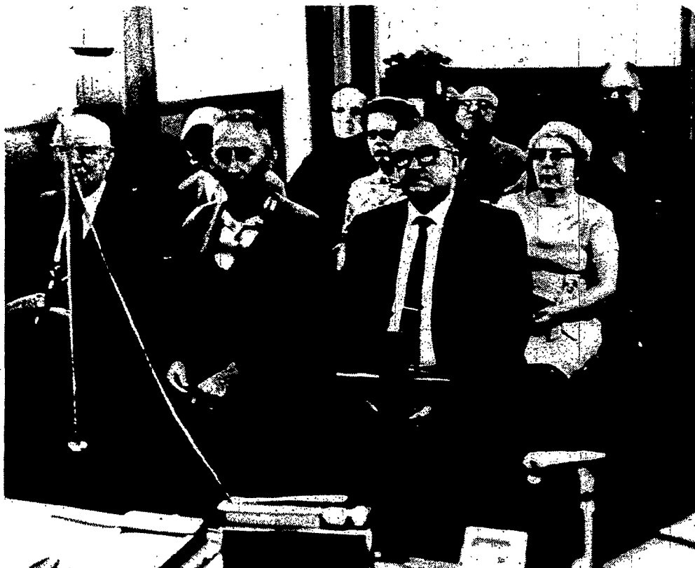
Knights of St. John from St. Michael's parish join regular members of the audience for the broadcast.