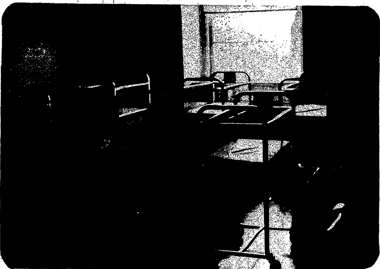
Signs of the times: empty cradles in St. Mary's nursery graphically demonstrate the rapid decline in the American birth rate; another change from previous years is the fathers' dressing room, where gowns can be donned.