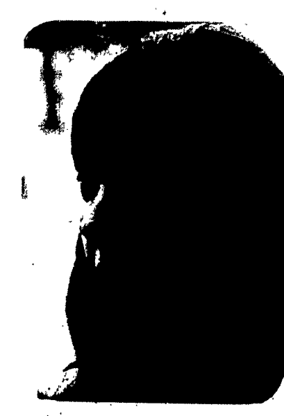
· · ·