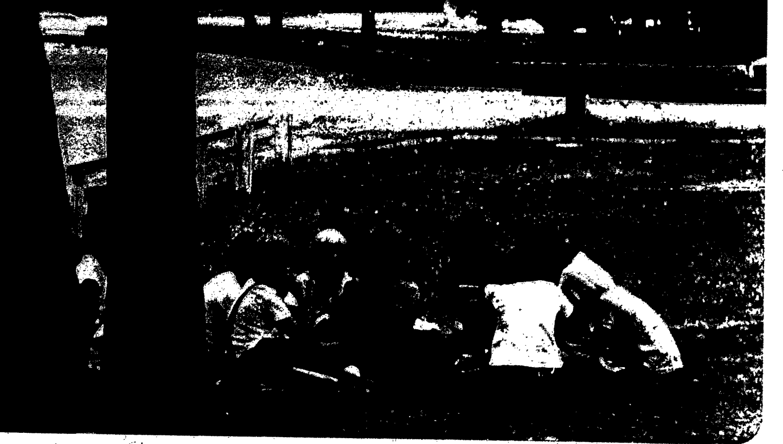
Counselor Eileen Foley (facing camera) sits with her group of girls awaiting noon activities.