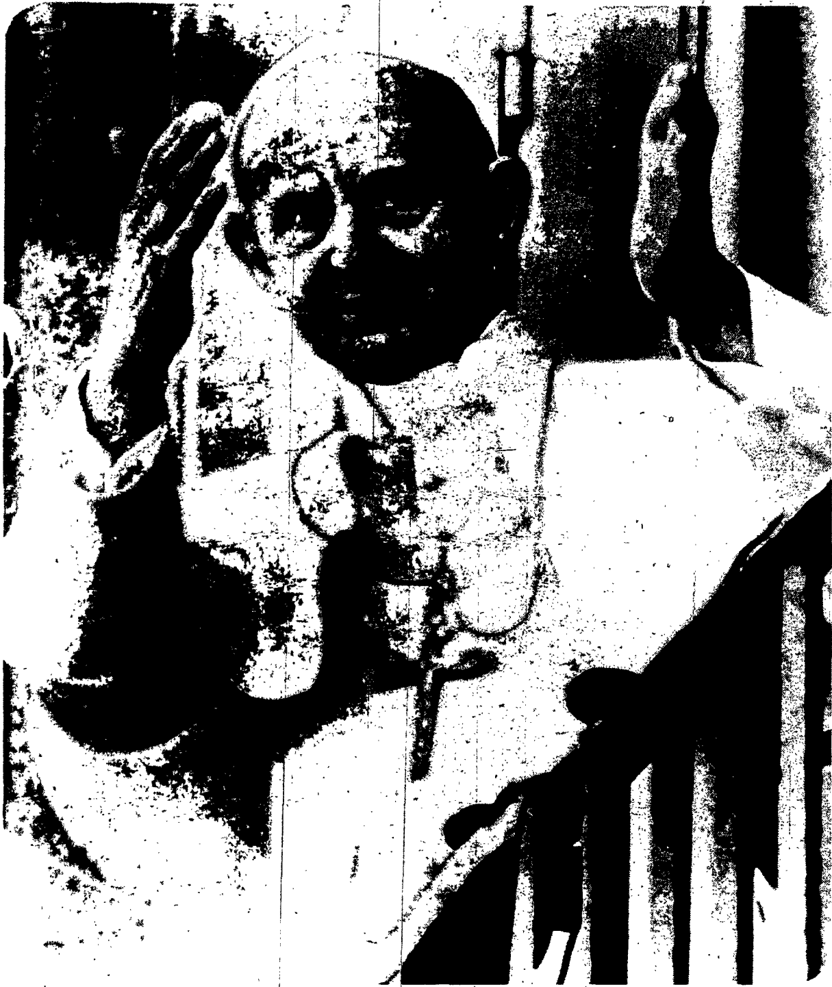
Greetings to Yugoslavia

Pope Paul VI acknowledges the cheers of the crowd after giving them his Sunday blessing from the terrace of his Summer home in Castelgandolfo, Italy. After the blessing, the pontiff — speaking in Serbian, Croatia and Slovene — broadcast special greetings to thousands of Catholics gathered in Yugoslavia at the end of two Marian congresses. The International Mariological-Marian Congresses, the first ever held in a Communist country, took place in Zagreb.