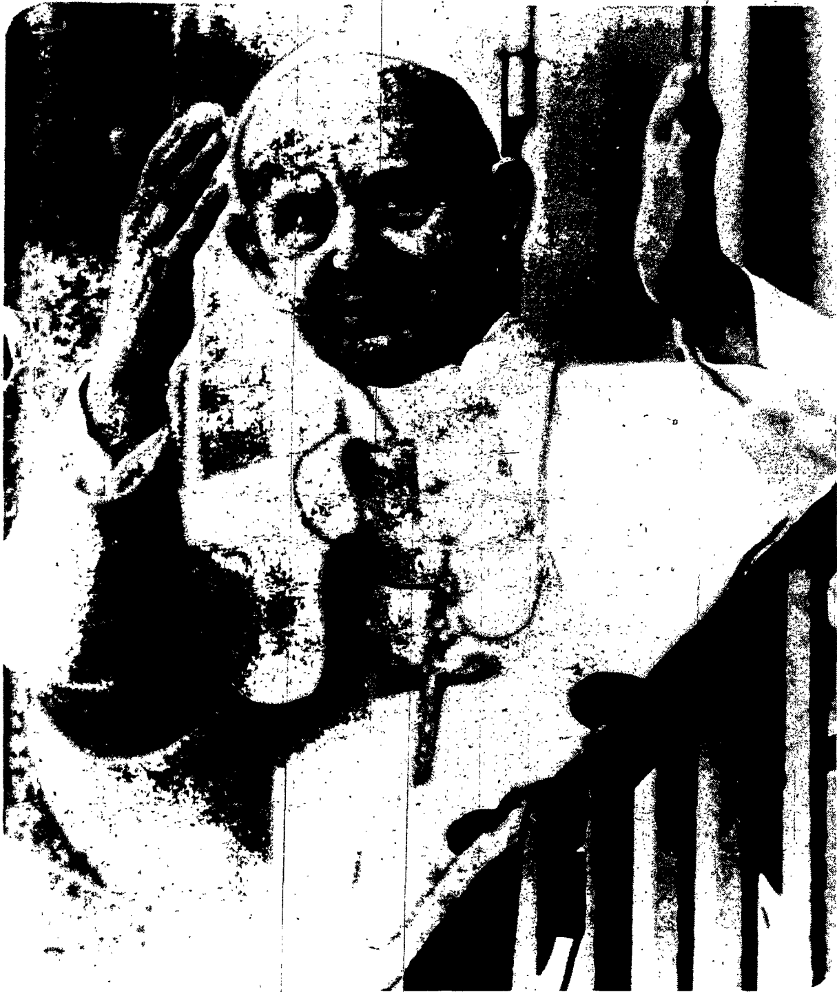
Greetings to Yugoslavia

Pope Paul VI acknowledges the cheers of the crowd after giving them his Sunday blessing from the terrace of his Summer home in Castelgandolfo, Italy. After the blessing, the pontiff — speaking in Serbian, Croatia and Slovene — broadcast special greetings to thousands of Catholics gathered in Yugoslavia at the end of two Marian congresses. The International Mariological-Marian Congresses, the first ever held in a Communist country, took place in Zagreb. (RNS)