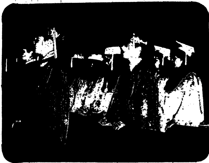
Graduates are singing "Peace on Earth," as their closing hymn.