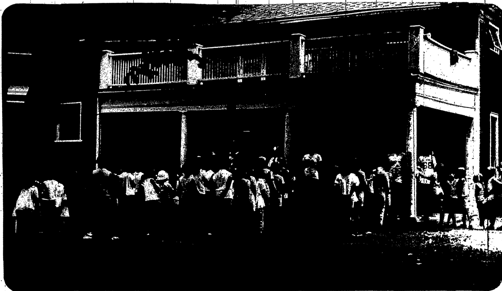
The girl's line up for lunch.