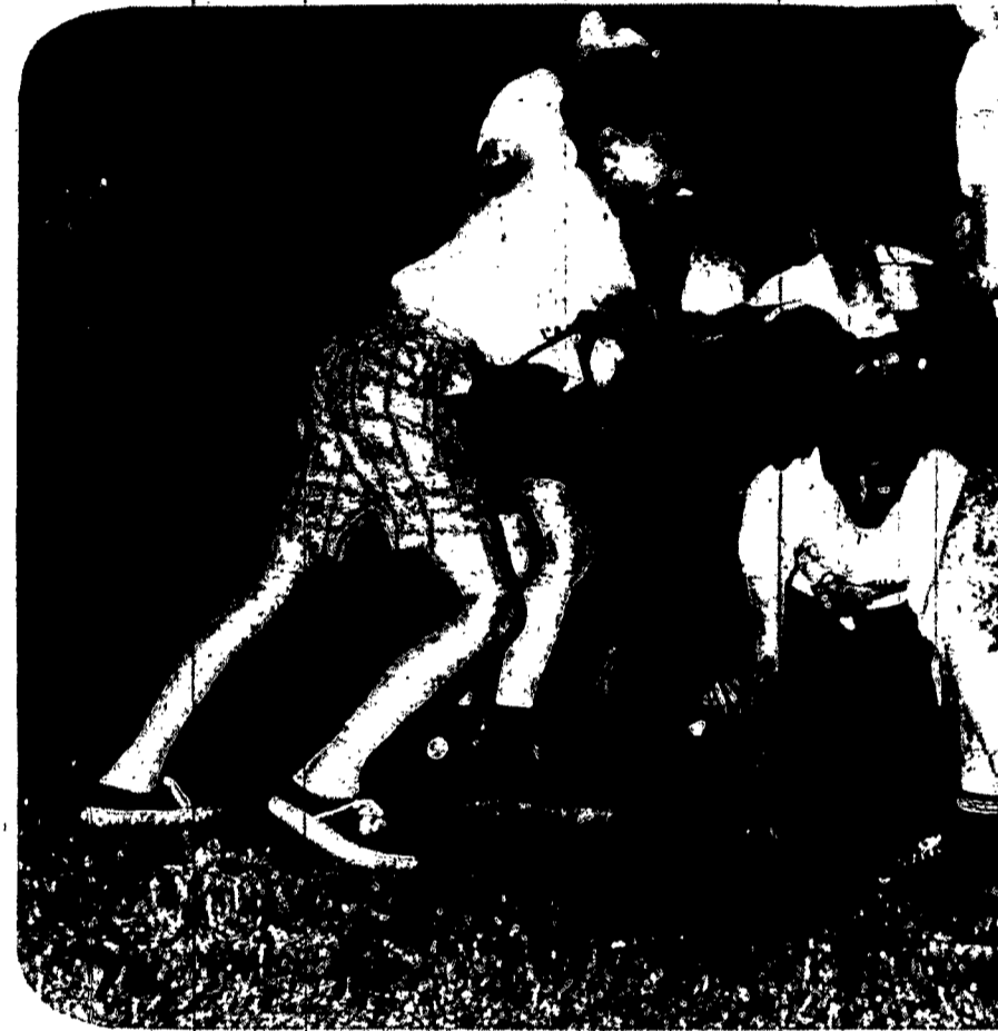
The boys make it rough for a counsellor