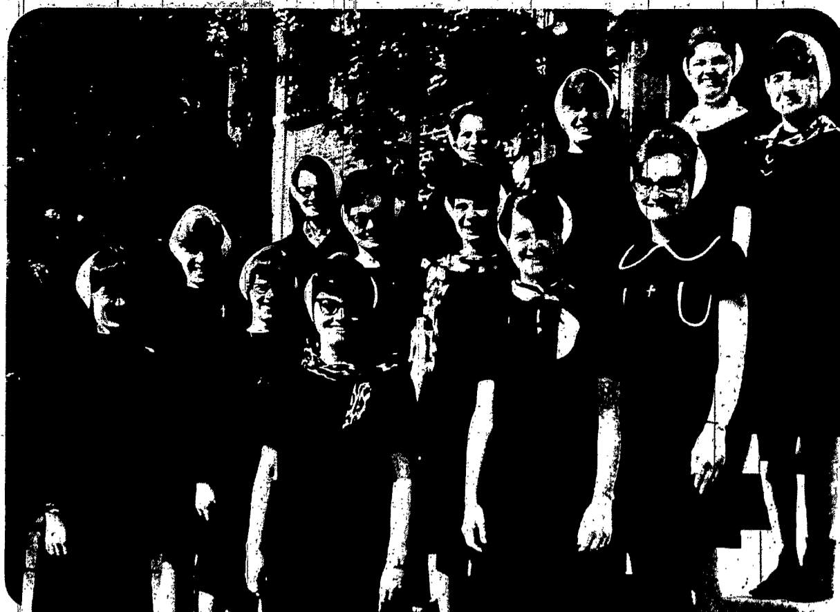
Sisters of St. Joseph who are professing final vows.