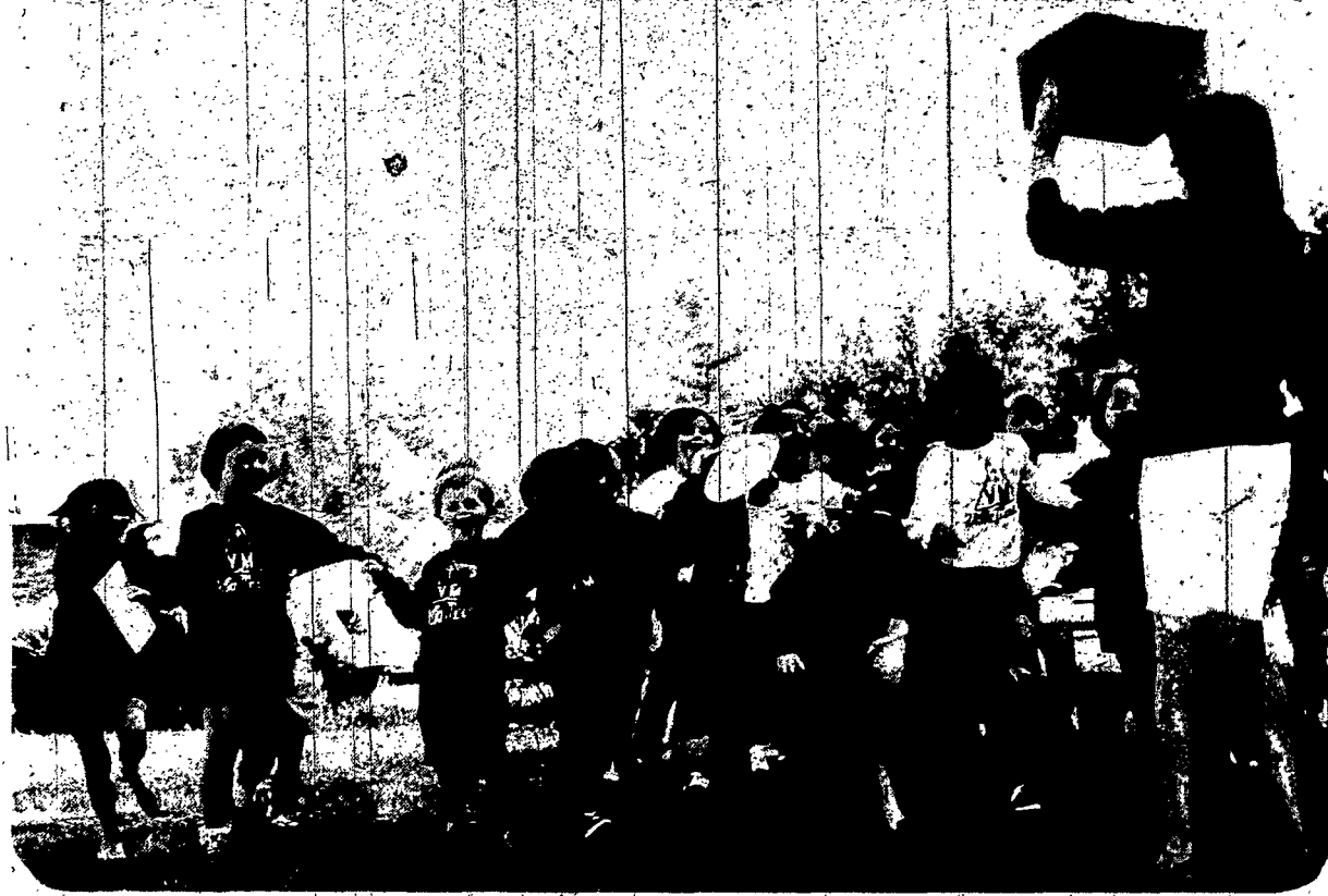
High-spirited Campers at Villa Maria