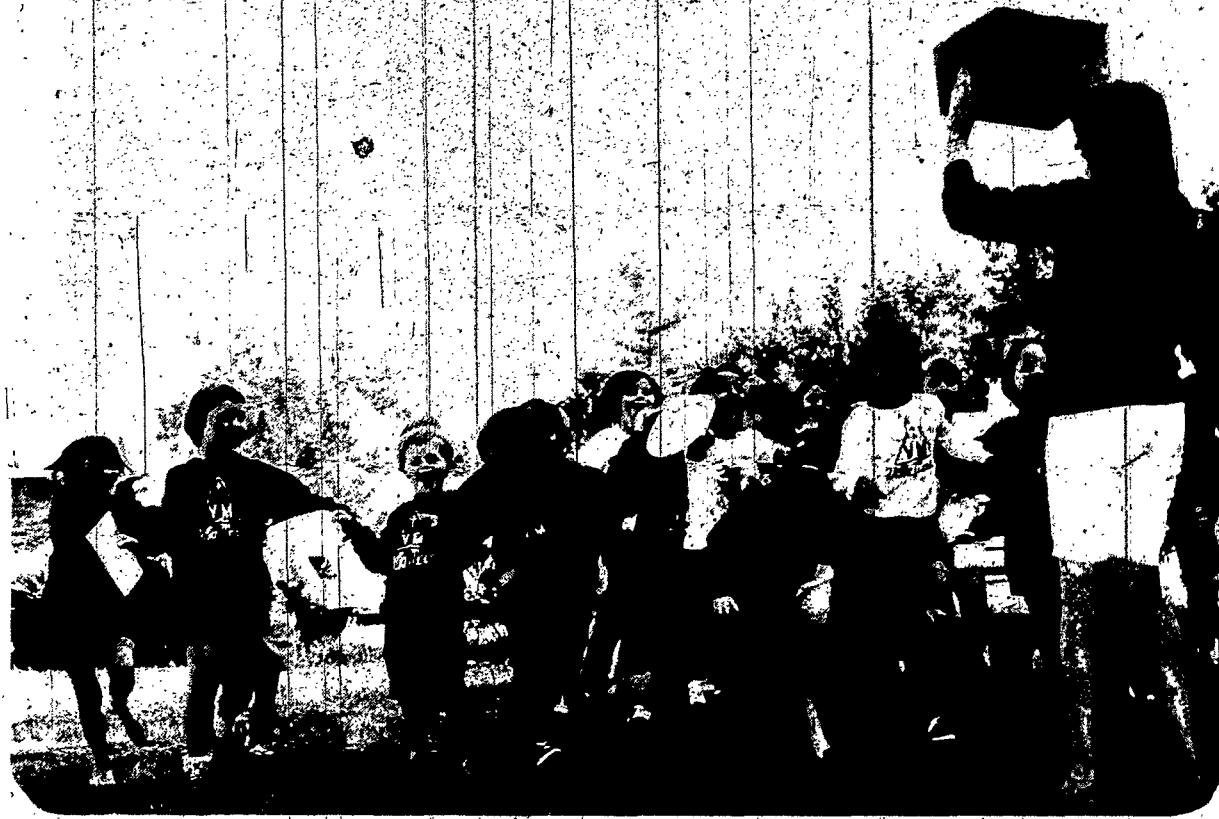
High-spirited Campers at Villa Maria