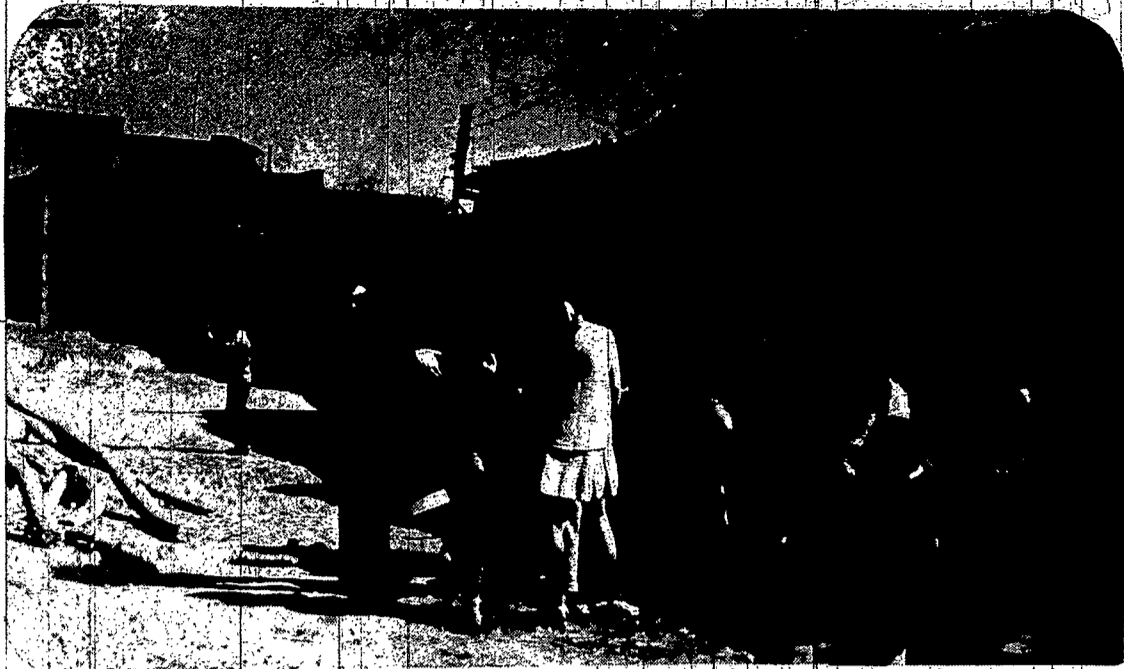
A Street Scene in Santiago