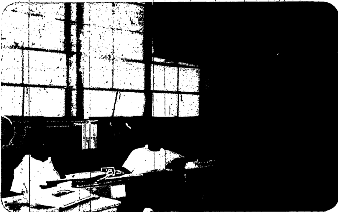
The Bishop gets a sceptical look from one student.

Diocesan Missions Sunday, 1971, might well be called the feast of the catholicity of the Church of Rochester, since its purpose is to make us keenly aware that the obligation of spreading the faith is imposed on every disciple of Christ.