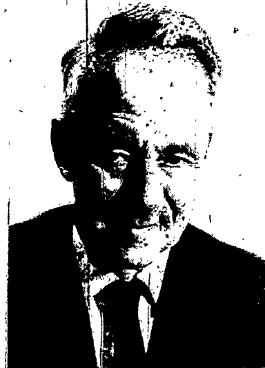
DR. COLIN CLARK

Dr. Clark, whose academic credits include degrees in statistics, economics and agriculture, is the author of several treatises on population problems which have merited the respect and applause of the scientific world. He contends that the problem does not concern overpopulation but population distribution. He says there is enough food to feed the world's population, and that, given the foreseeable progress of agricultural technology, there will be enough food to feed the world population of tomorrow.