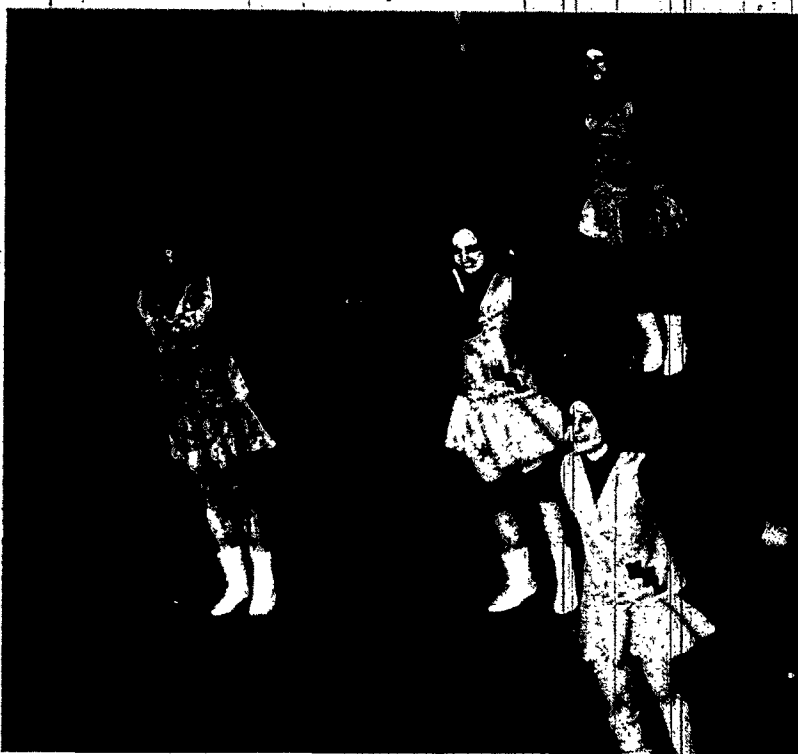
The girls from Honeoye Falls show hometown spirit.