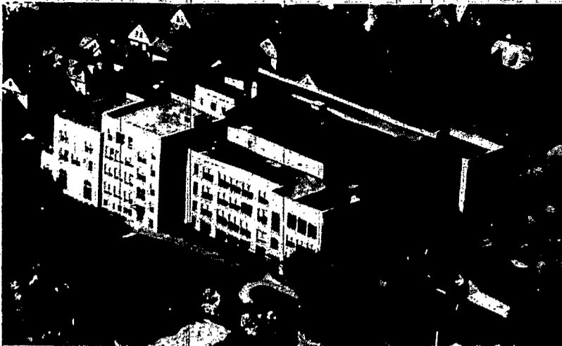
Aerial view of Nazareth Academy