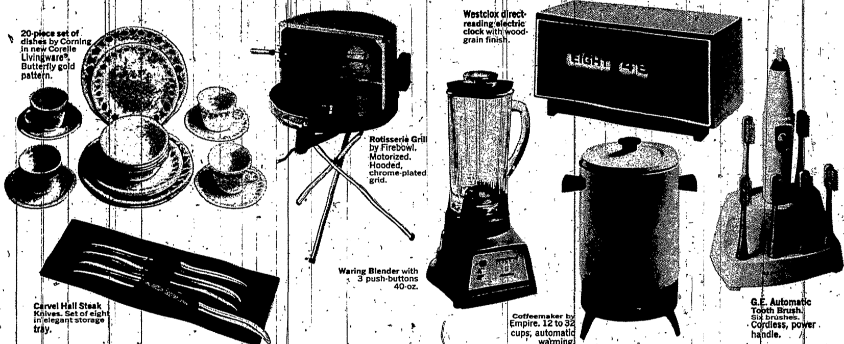
20-piece set of dishes by Corning in new Corning Livingware® Butterfly gold pattern.

Choose one of these FREE GIFTS for a new Bonus Term Account of $5,000 or more.