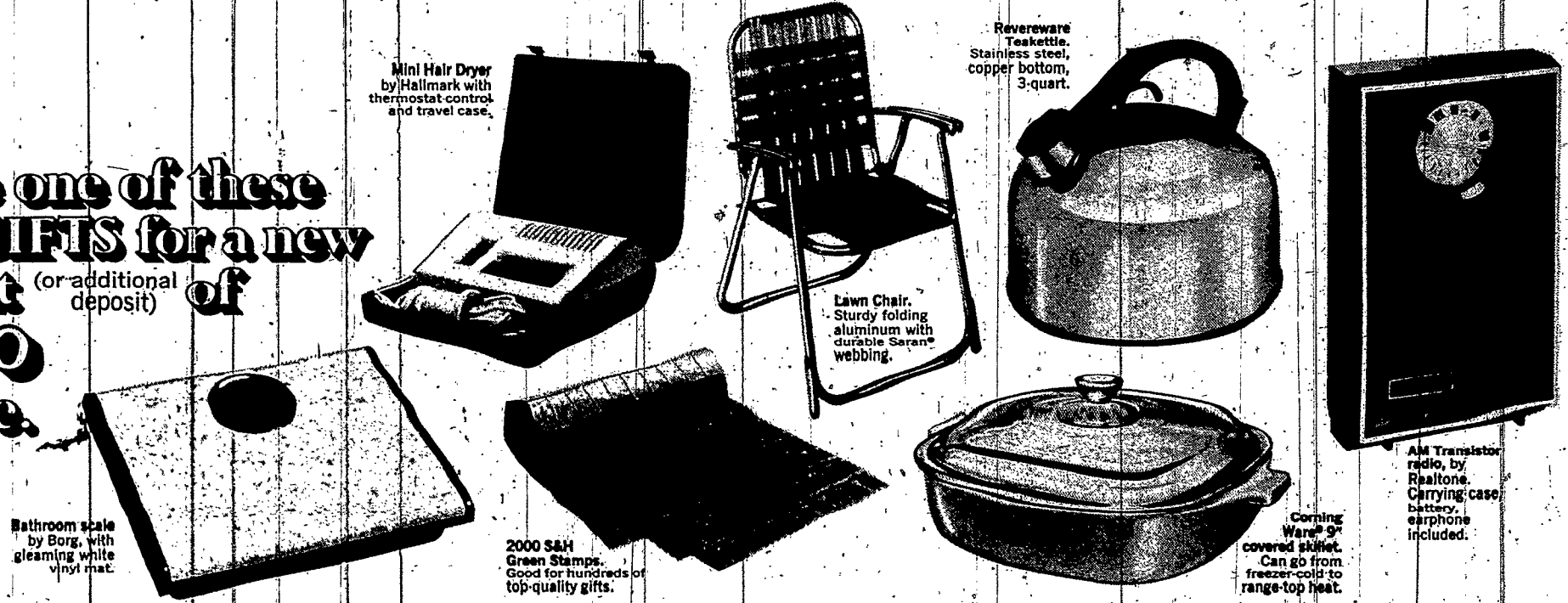
Mini Hair Dryer by Hallmark with thermostat control and travel case.

Choose one of these FREE GIFTS for a new account (or additional deposit) of $1,000 or more.