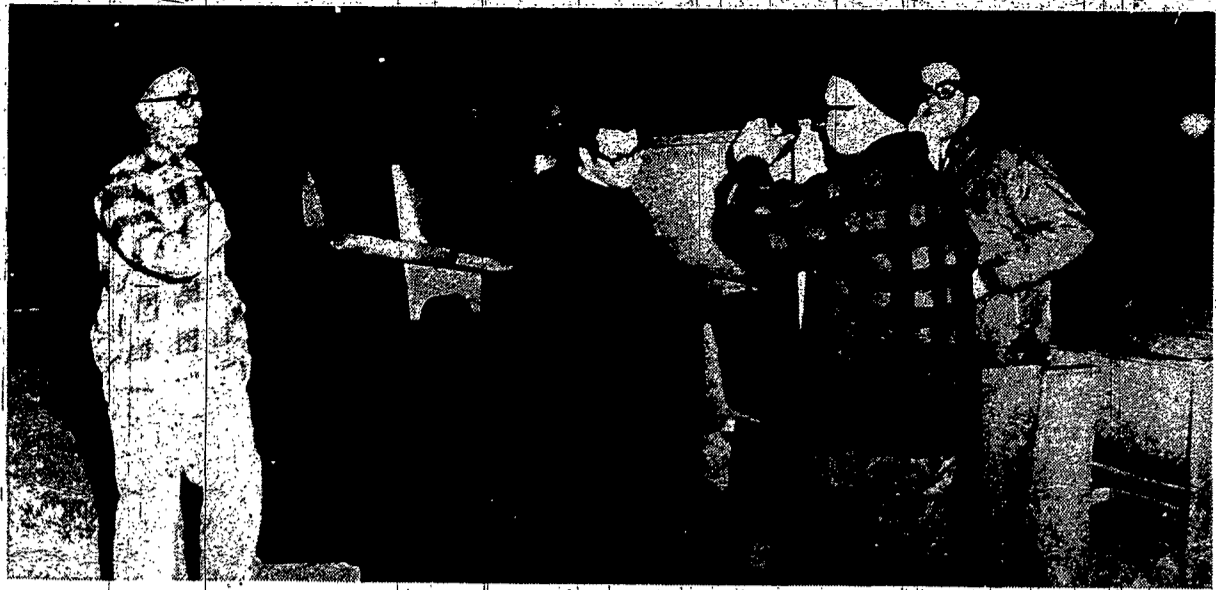
Moving night for St. Pius X Church

Help, somebody. I may never actually attain the status of Type I. But I'd sure like to try.