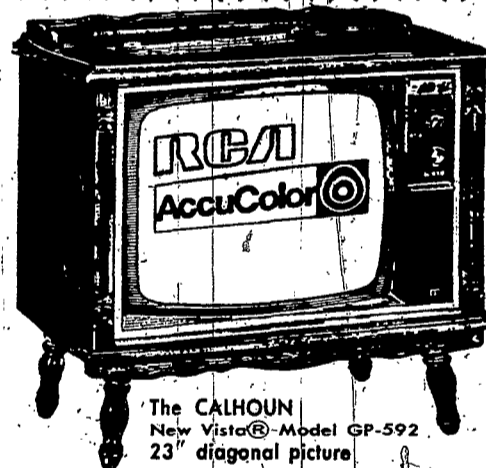
The CALHOUN New Vista® Model GP-592 23" diagonal picture

BIG 23" DIAGONAL SCREEN SIZE IN YOUR CHOICE OF FURNITURE STYLES AND AT ACTION DAY PRICES! RCA ACCU- COLOR GIVES YOU THE FEATURES YOU WANT MOST IN A COLOR SET. BRILLIANT COLOR, DEPENDABLE PERFORM- ANCE, FIDDLE FREE TUNING.