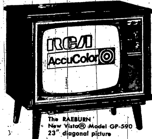
The RAEBURN New Vista® Model GP-590 23" diagonal picture

See Our Complete Selection of RCA AccuColor Models