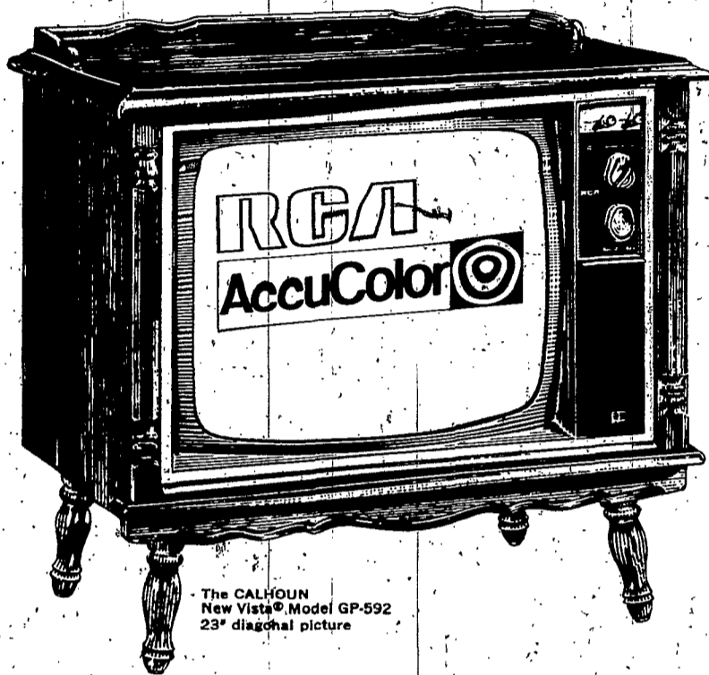
The CALHOUN New Vista® Model GP-592 23" diagonal picture