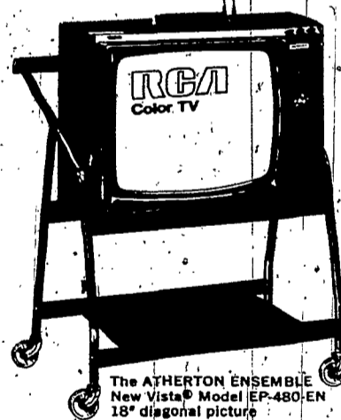
The ATHERTON ENSEMBLE New Vista® Model EP-480-EN 18" diagonal picture