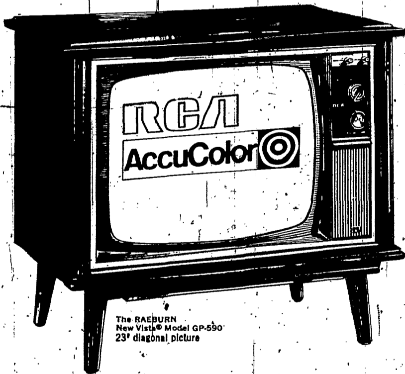
The RAEBURN New Vista® Model GP-590 23" diagonal picture

Model for model; dollar for dollar, RCA AccuColor is your best Color TV buy. Gives you the performance, the convenience features and the built-in dependability you want. And now, during AccuColor Action Days—take your choice of styles in values that are greater than ever.