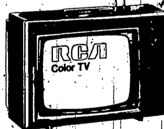
The VOGUE, Model EP-402 14" diagonal picture