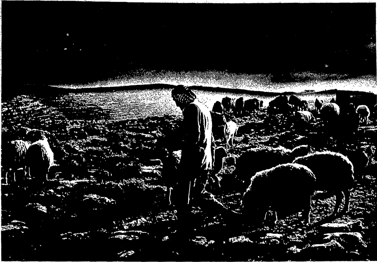
Shepherd — 1970 Style

Shepherds still tend their sheep in the sparse vegetation of the Judean hills above Bethlehem much as they did on that first Christmas. (RNS).