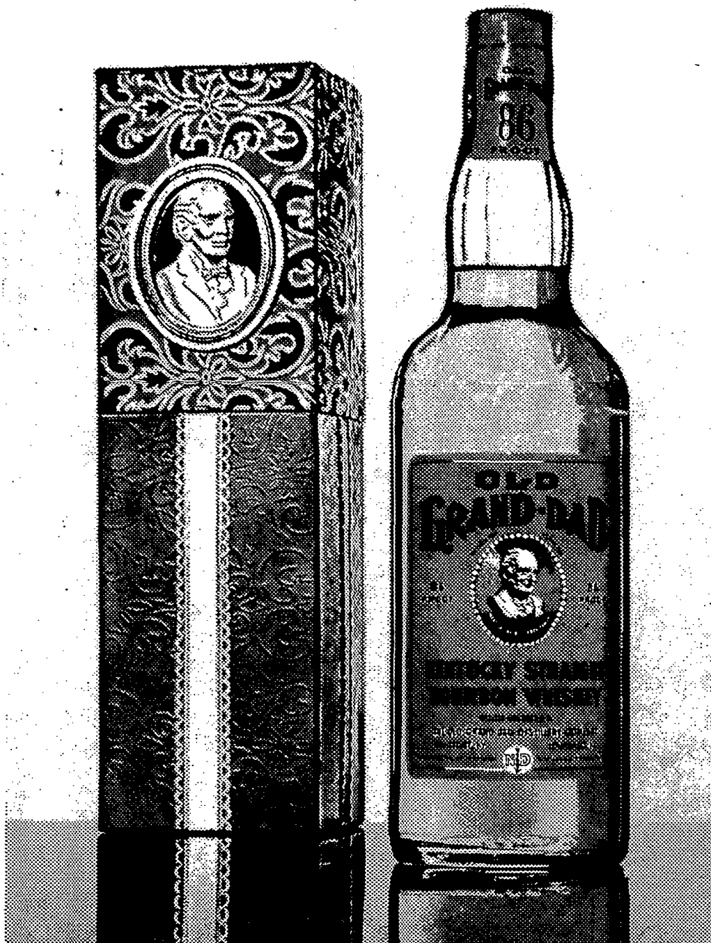
86 Proof in Red Gift Wrap... 100 Proof in Blue.

Gift-wraps will be available in Washington State liquor stores beginning November 23.