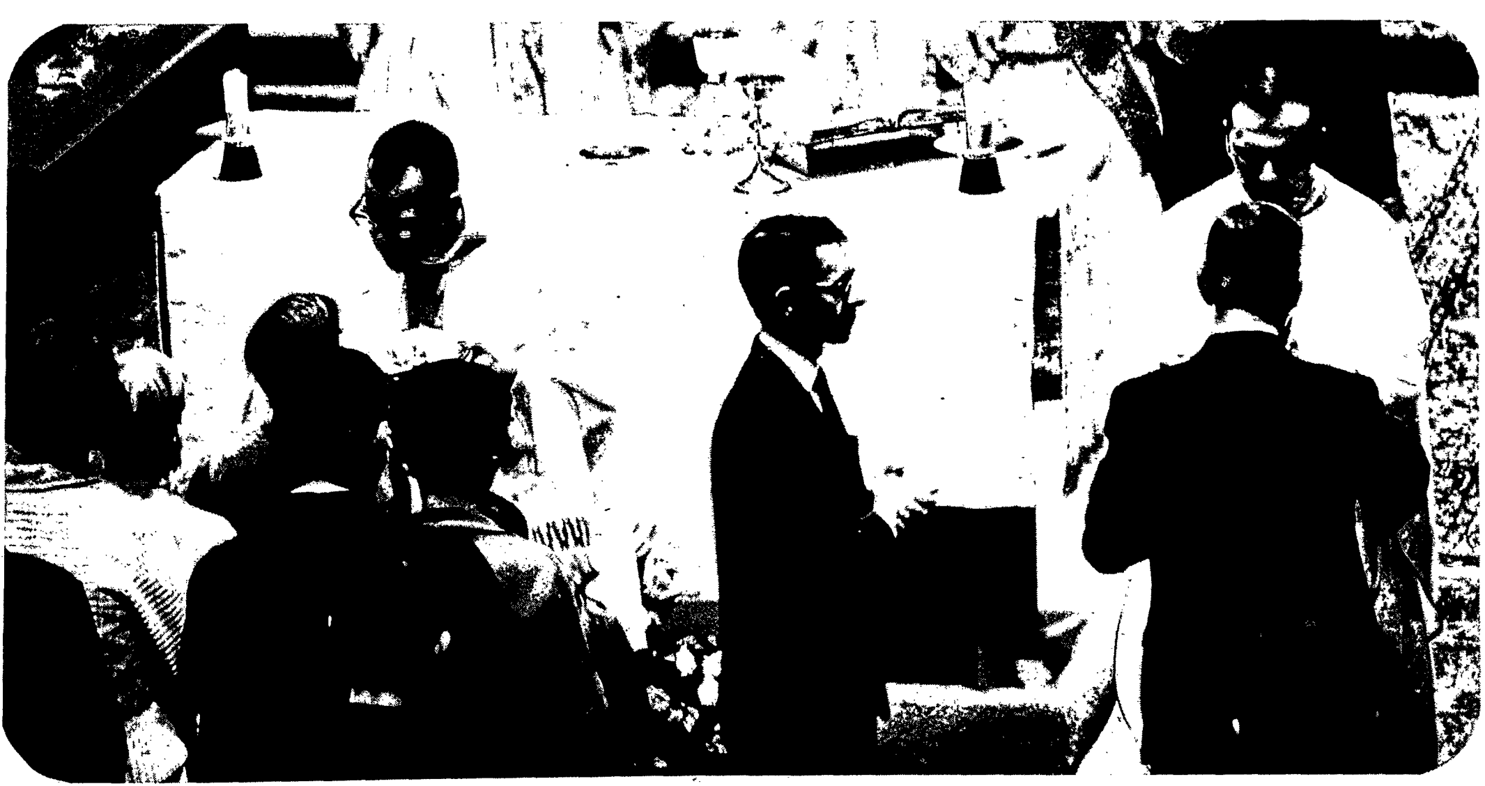
Seminarians are joined by relatives and friends at public Mass and supper each Thursday at 5 p.m.