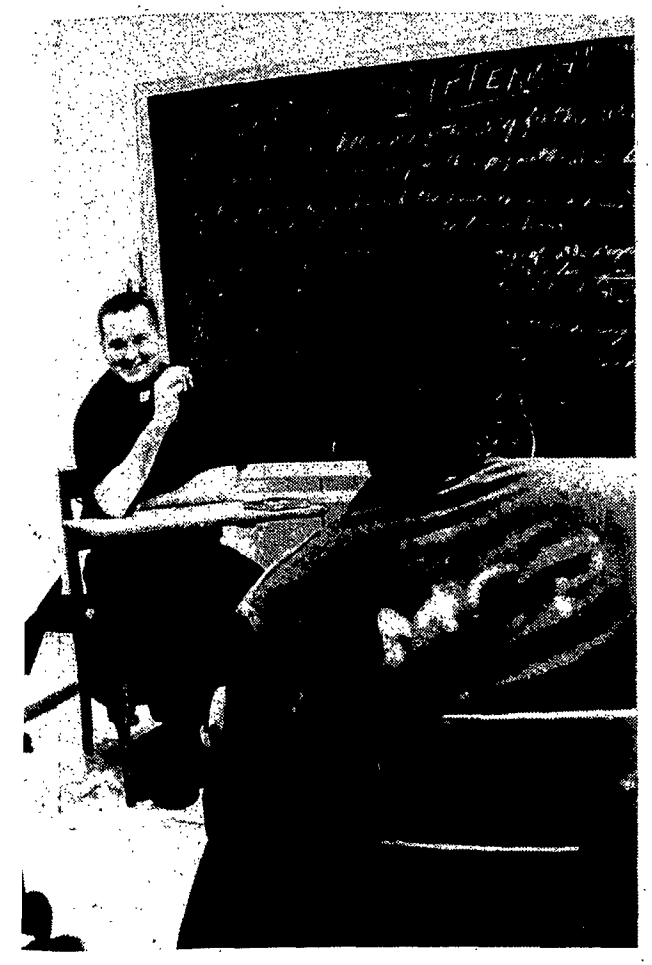
•g" with inmates at Monroe County principle.