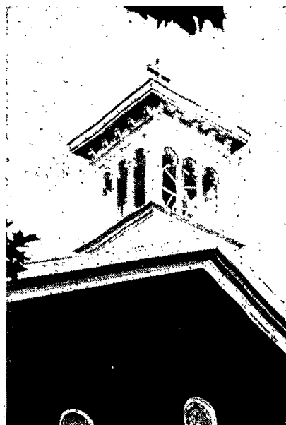
St. Anne's, Palmyra