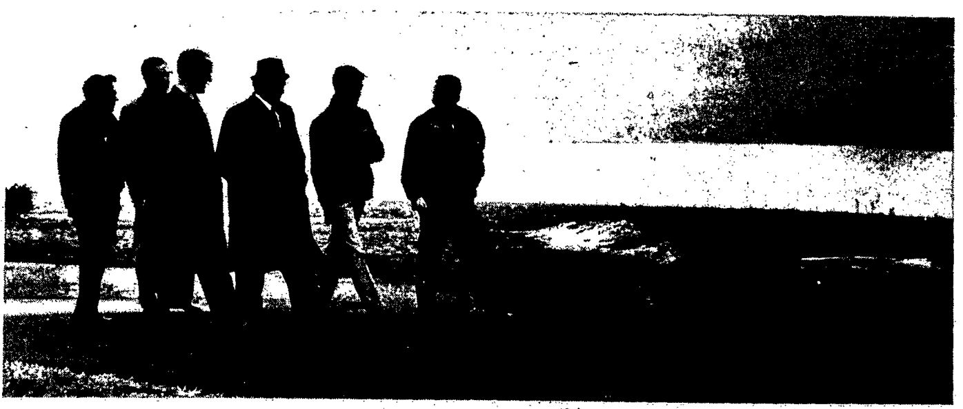
Retreatants go for a stroll . . . Canandaigua Lake in background, Station of Cross at right [COURIER/2] Wednesday, July 1, 1970