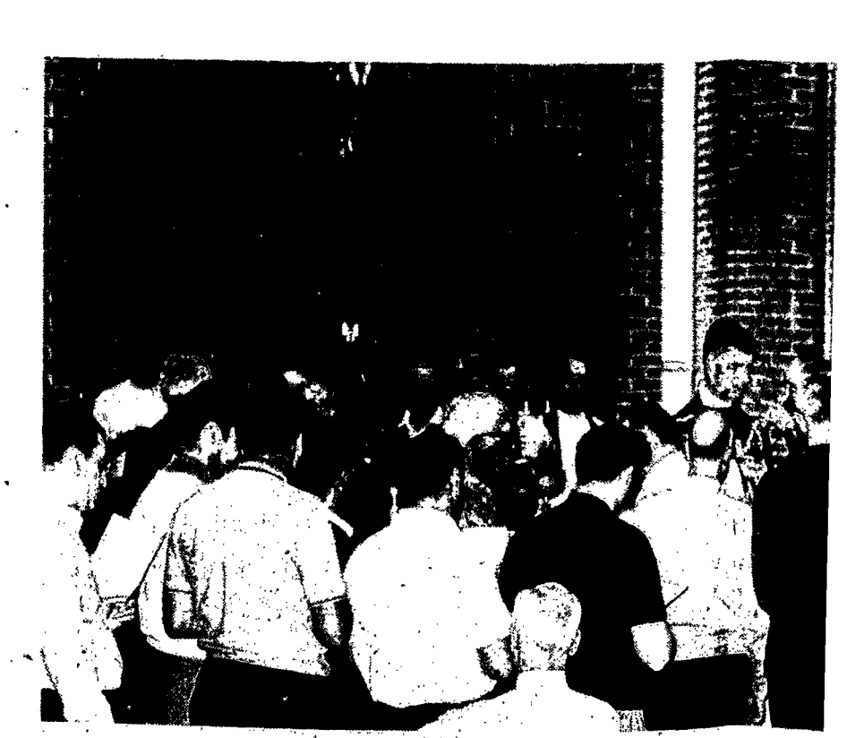
Distribution of Holy Communicaduring