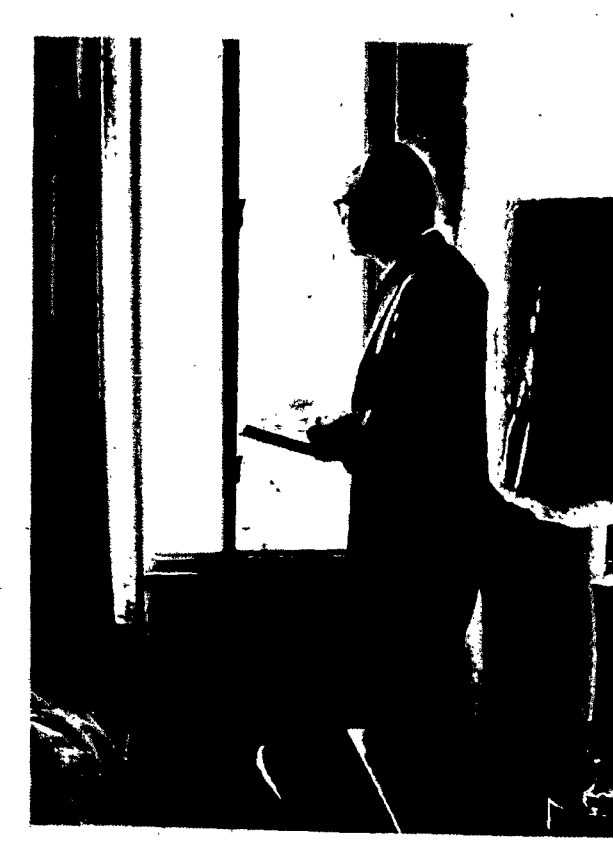
Retreatant reads, glances out over lake