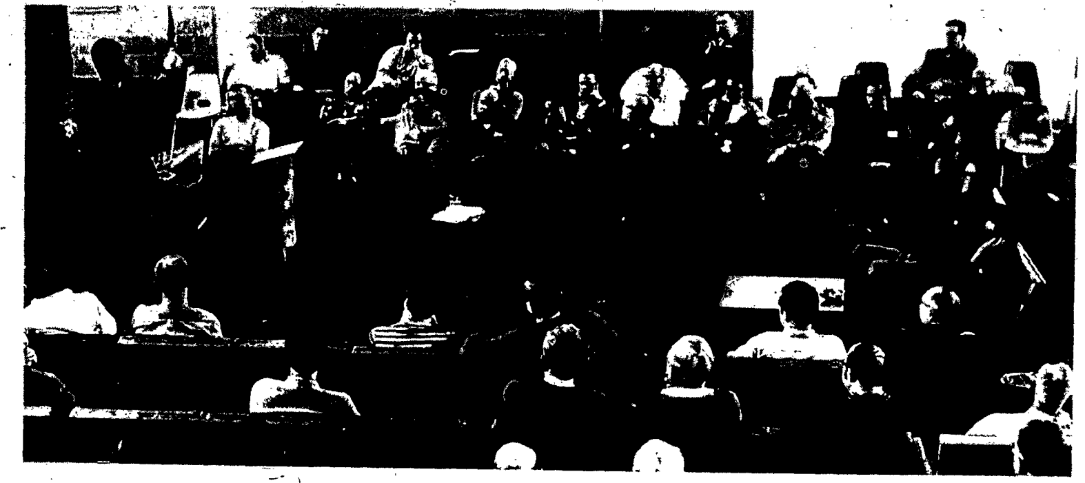
Conferences in the lounge are informal, with plenty of "dialogue" and "feed-back"