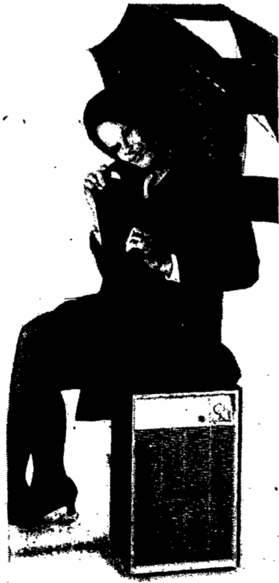
A dehumidifier gives you sure protection in damp weather.

RG&E, 89 East Avenue, has Westinghouse Dehumidifier (Model ECJ20) priced at $107.00. Budget terms available. If you prefer to order by phone, call 546-2700, extension 2428.