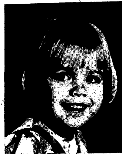
Bring your child to our Photograph Studio, 5th Floor

ENTER NOW! 36th National Children's PHOTOGRAPH CONTEST