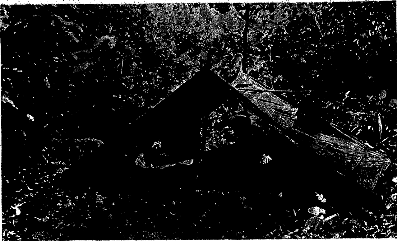
Monsoon downpour traps three First Air Cavalry troopers under makeshift tent in the deepening mud of Hill 432, about 17 miles inside Cambodia.