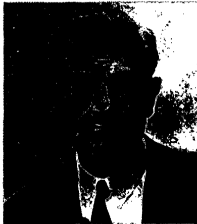
HENRY CABOT LODGE

Lodge was last received in papal audience on Jan. 16, 1967 — after he had ended two tours as ambassador in Vietnam for President Johnson and before heading the Paris negotiating