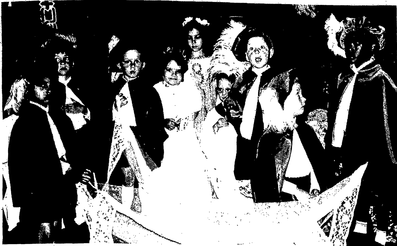
Blessed Mother Statue Crowned at Holy Redeemer Youngsters at Holy Redeemer Church, Rochester, pictured at annual May Queen crowning ceremony there May 24.