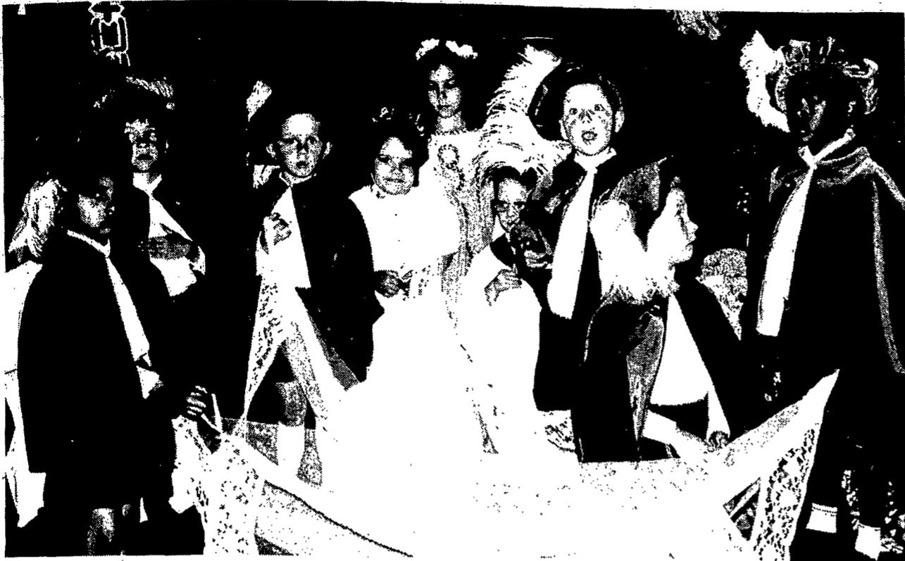
Blessed Mother Statue Crowned at Holy Redeemer Youngsters at Holy Redeemer Church, Rochester, pictured at annual May Queen crowning ceremony there May 24.