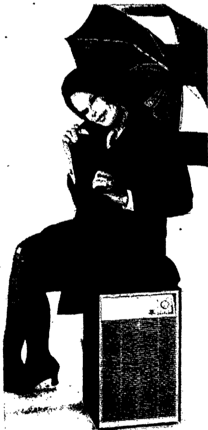
A dehumidifier gives you sure protection in damp weather.

RG&E, 89 East Avenue, has Westinghouse Dehumidifier (Model ECJ20) priced at $107.00. Budget terms available. If you prefer to order by phone, call 546-2700, extension 2428.