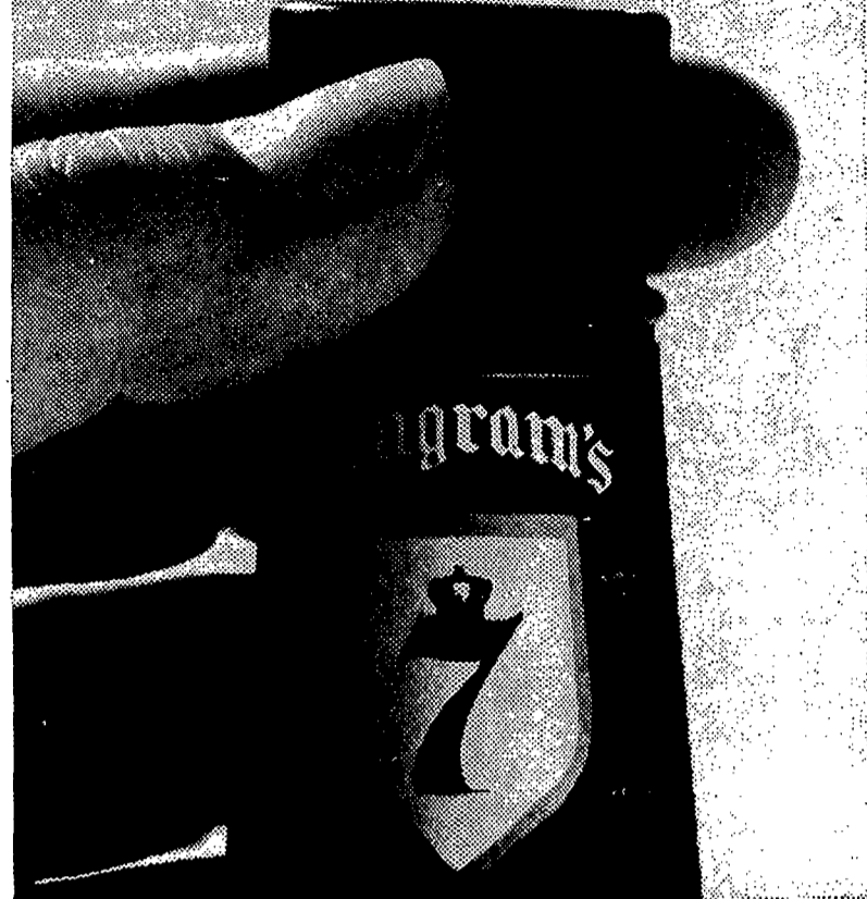
SEAGRAM DISTILLERS COMPANY, N.Y.C., BLENDED WHISKEY. 86 PROOF. 65% GRAIN NEUTRAL SPIRITS.

If you want a better whiskey go right to the top. Seagram's 7 Crown. Say Seagram's and Be Sure.