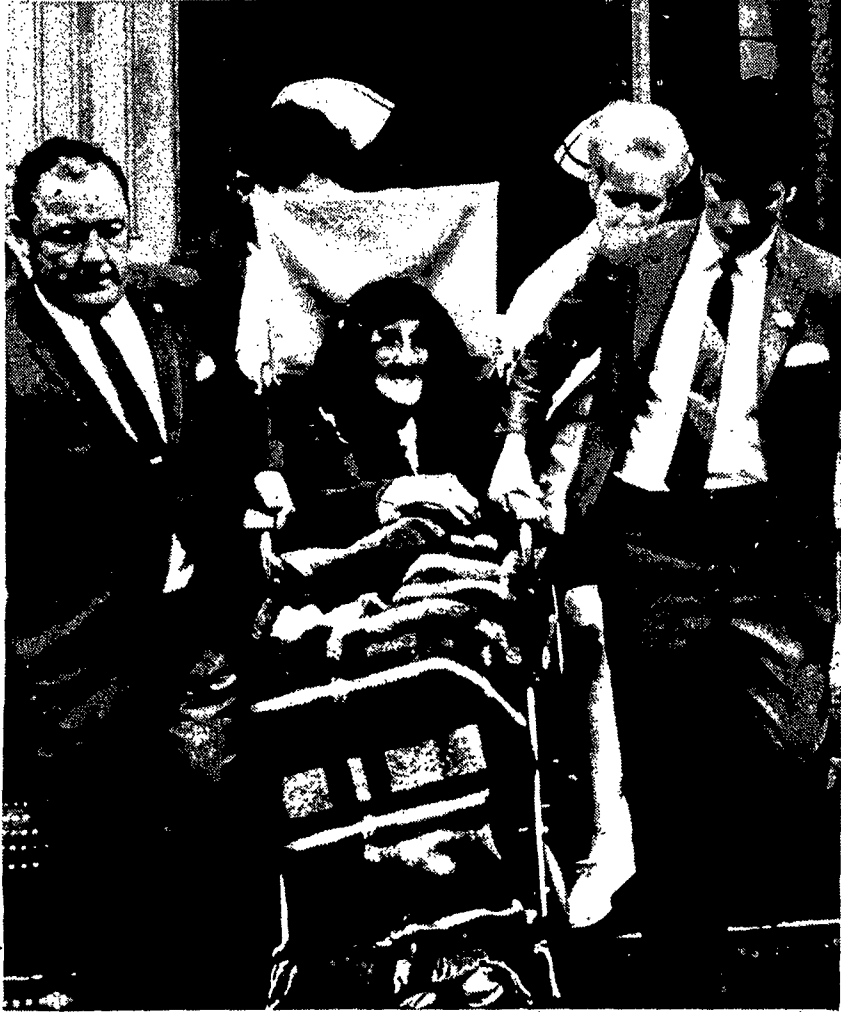
Priests' Mother at 'Mass for Sick'