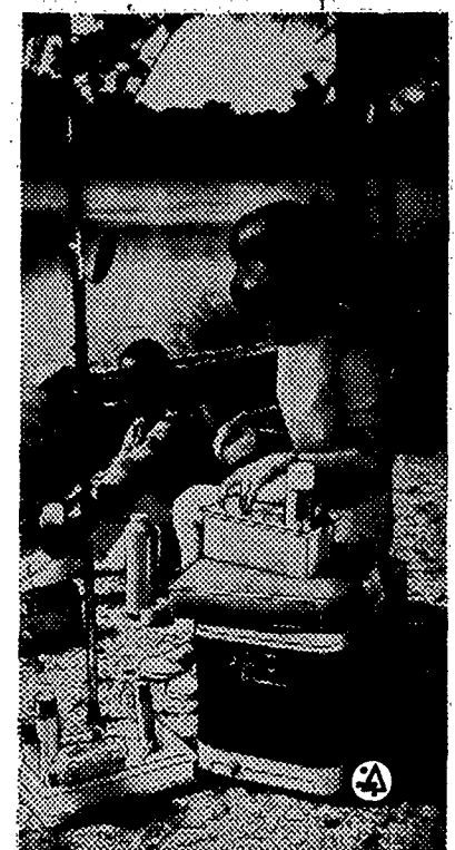
Imagine the convenience of an outdoor beauty parlor, as pictured above, with the help of plastic containers from the kitchen.