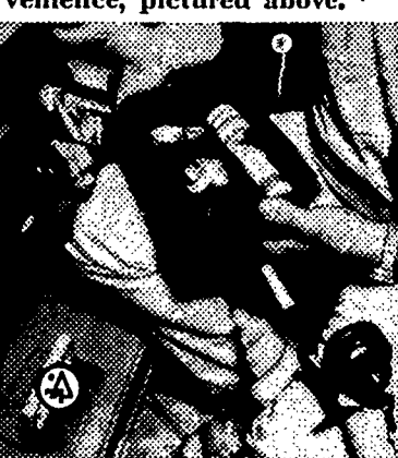
ent compact carrier in the versatile new Stow-N-Go, as pictured above, by Tupperware.