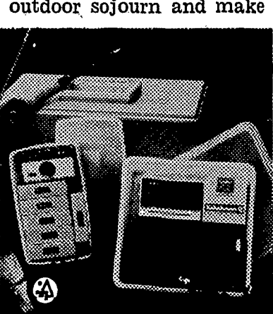
Remarkable, isn't it, how compactly one can Stow-N-Go, fully equipped with film and camera in the newest Tupperware convenience, pictured above.

An easily obtainable means of keeping food and equipment dry and clean is plastic containers. Tupperware