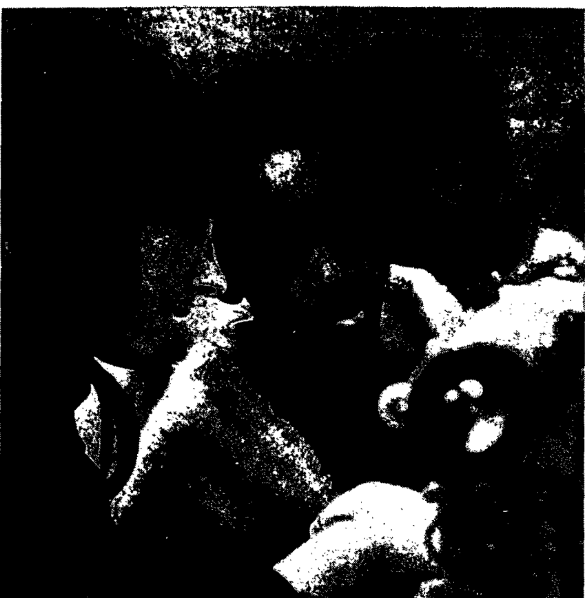
... And a little girl tries her hand at sewing ...