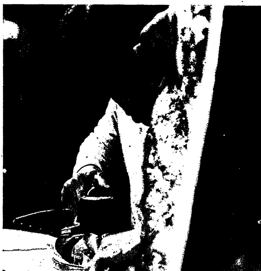
... And another, at ironing.