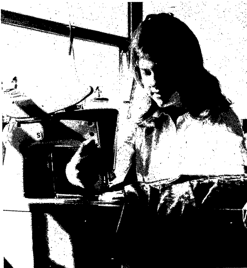
Costumes come into being during the two months before opening night.