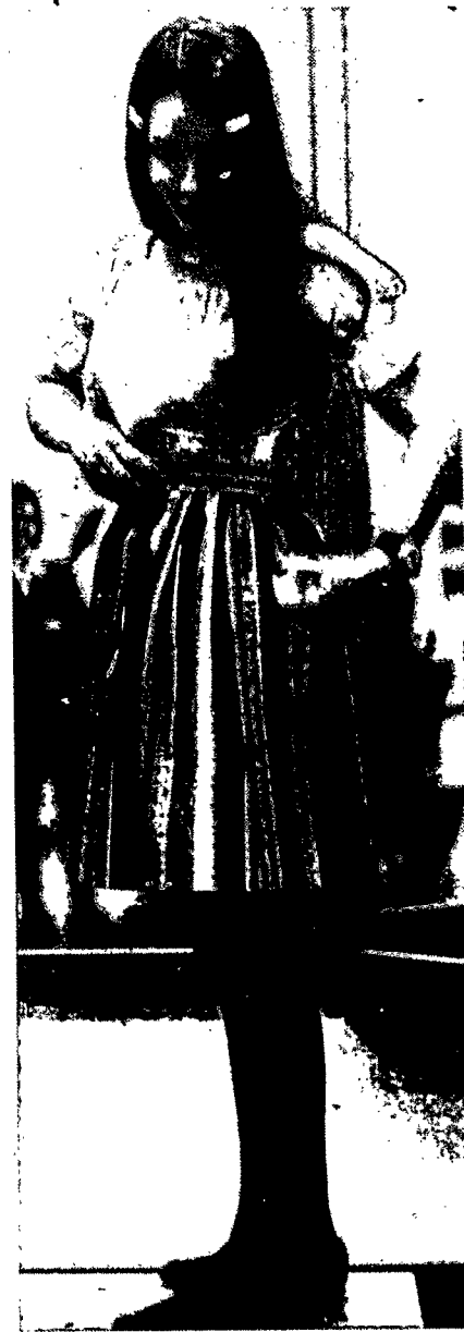
After costumes are finished, they are tried on, altered, and given final approval.