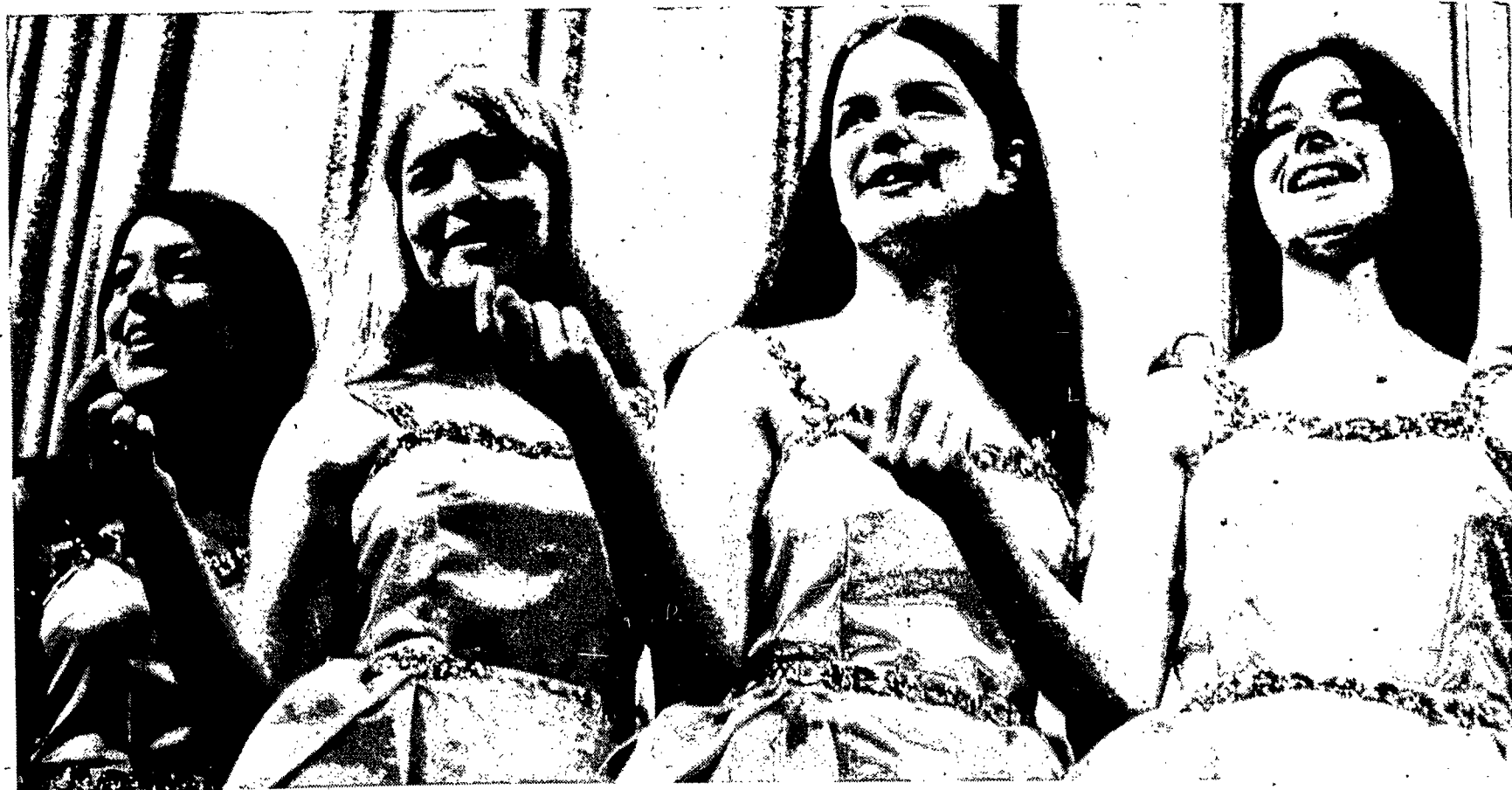
... Until that magic moment when house lights dim, curtain rises and the cast bursts exuberantly into opening song.