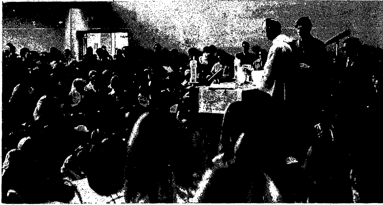
First Mass in St. Paul's Church, Webster