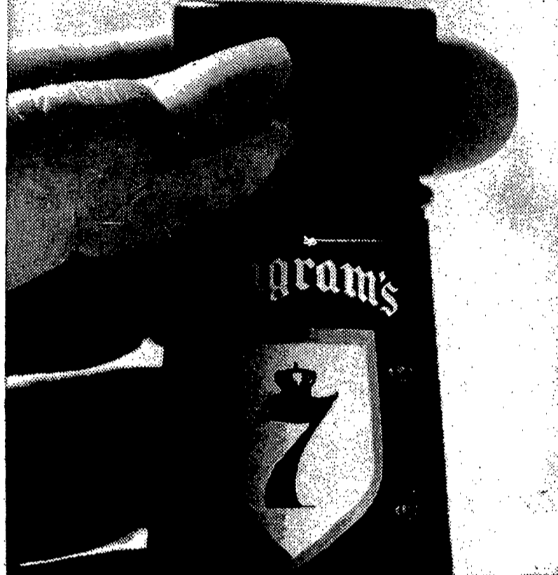
SEAGRAM DISTILLERS COMPANY, N.Y.C., BLENDED WHISKEY. 86 PROOF. 65% GRAIN NEUTRAL SPIRITS.

If you want a better whiskey go right to the top. Seagram's 7 Crown. Say Seagram's and Be Sure.