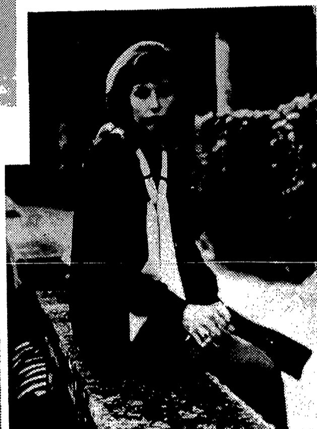
a broken date . . .