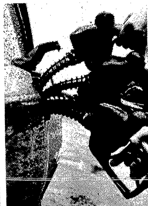
a gas pump affair!

An untuned car is all kinds of trouble! But it's trouble you can avoid right now by getting a Champion Tune-Up. That's a new set of Champion spark plugs plus other basic tune-up items your car may need. You'll enjoy quicker acceleration for safer passing, and better gas mileage too. And make sure you specify a Champion Tune-Up . More than 20 million motorists have already switched to Champion from other brands. The reason? Better performance! Tune up with Champions once a year—or every 10,000 miles.