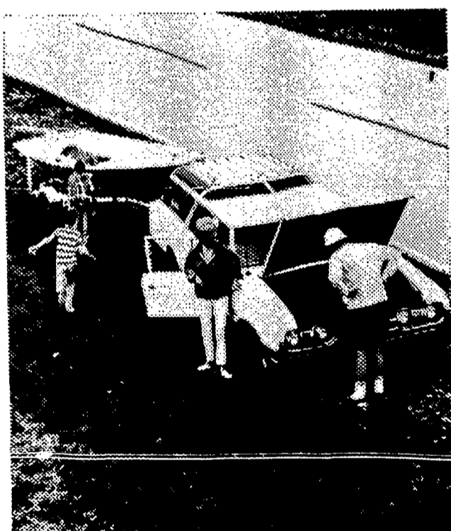
a trip delayed . . .