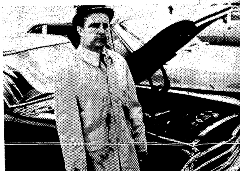
a dirty shame . . .