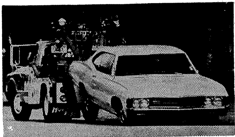
a tow truck ride . . .