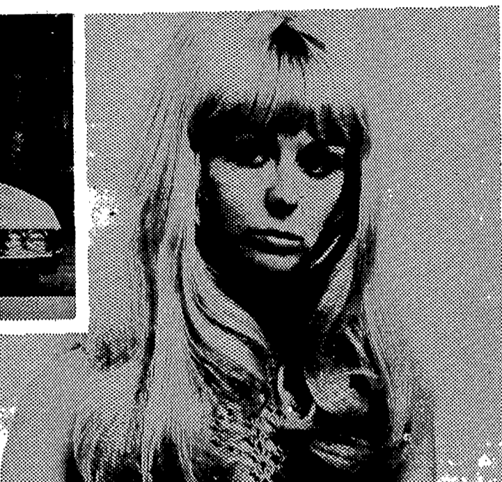
a kiss un-kissed . . .