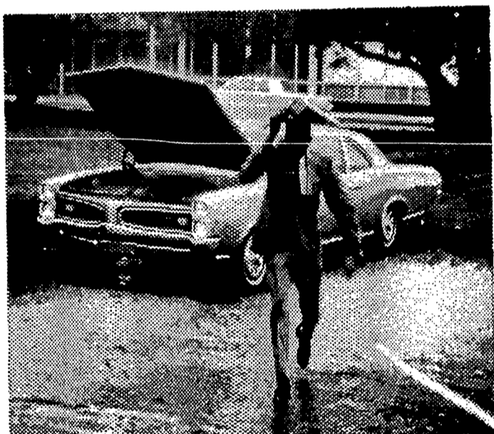
rain down your neck . . .