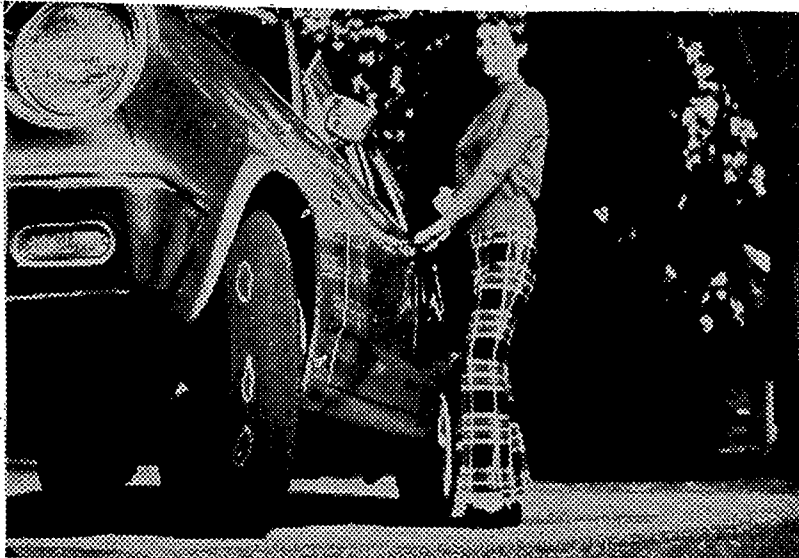
Her trip may be shorter than she's planned from the look of her tires. Some tire damage is not as obvious as this, so it pays to have your favorite serviceman inspect for damage on your next visit.

Your tires are the only contact between you and the road. Should they fail, you are in danger. Also, they represent a substantial portion of the total value of your car. So, both in safety and in economy, proper tire care is like money in the bank.