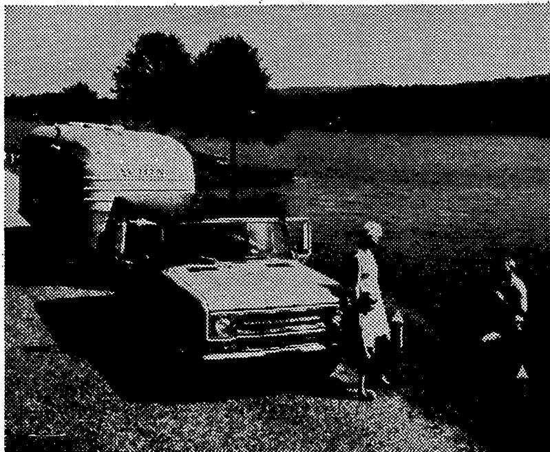
The family pauses momentarily while driving through Callaway Gardens, Pine Mountain, Ga., for dad to make pictures, while on its way to nearby state park. Facilities for setting up its camper trailer, towed by an International Travelall, are conveniently available.

The U.S. government now has developed camp grounds and more primitive camping areas in 30 national parks and more than 150 national forests, including wilderness areas where there are no roads and vehicles are pro-