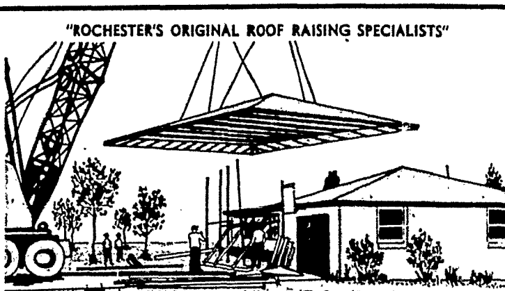
"ROCHESTER'S ORIGINAL ROOF RAISING SPECIALISTS"