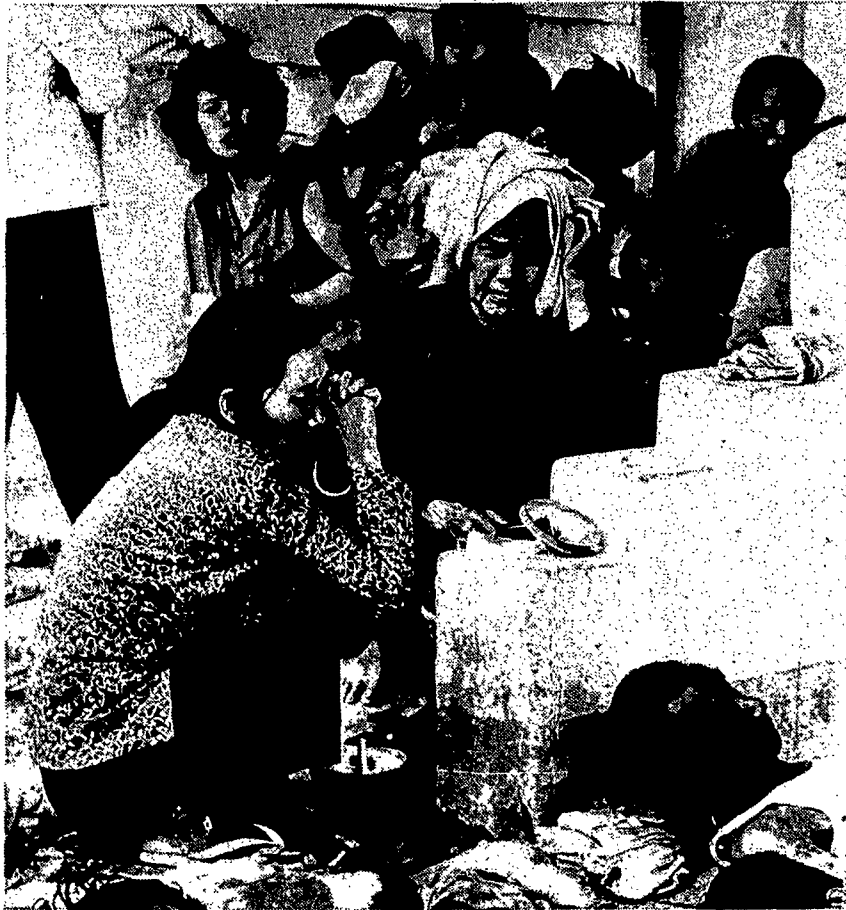
Vietnamese civilian survivors of a battle between combined Vietcong and North Vietnamese forces and Cambodian army occurring April 9 in Prasot, Cambodia, rest in the yard of a farm co-op where they had been detained as Vietcong suspects. Reports were that at least 89 were killed in cross-fire.