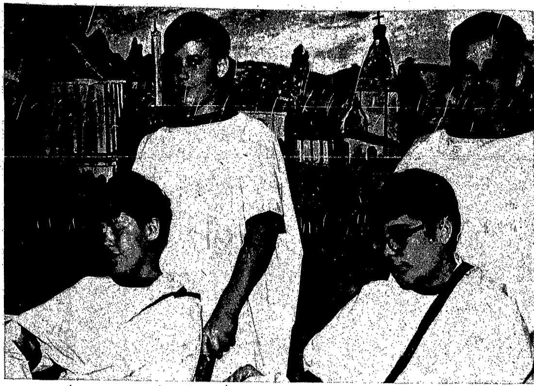
Ancient Rome in Corning