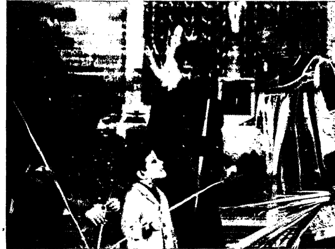
Family Gets Palms from Pastor