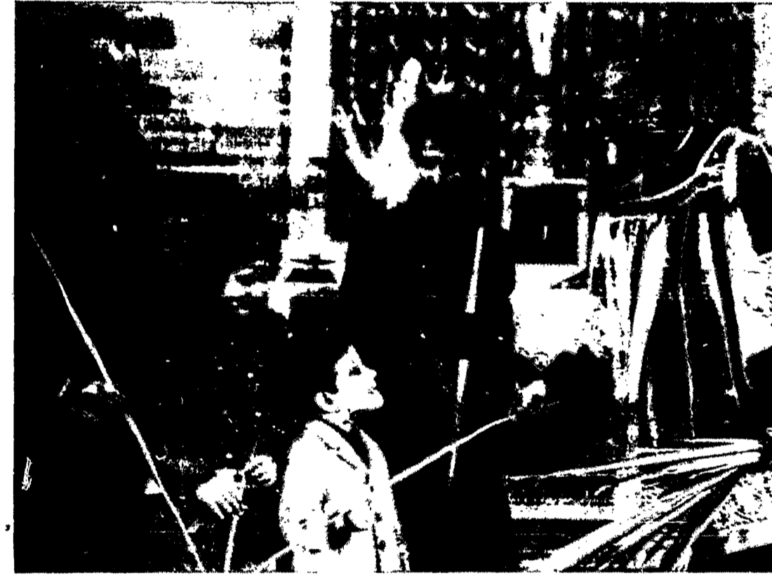
Family Gets Palms from Pastor