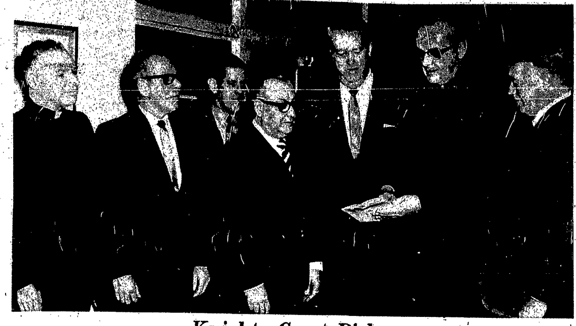
Knights Greet Bishop

FINGER LAKES * FIVE POINTS Laundries and Cleaners LIQUOR STORE Inc. COMPLETE HOME SERVICE Diaper Service Telephone 789-3300 AL 3-6051 58 Franklin St. Auburn, New York 511 Washington St. Geneva, N.Y.