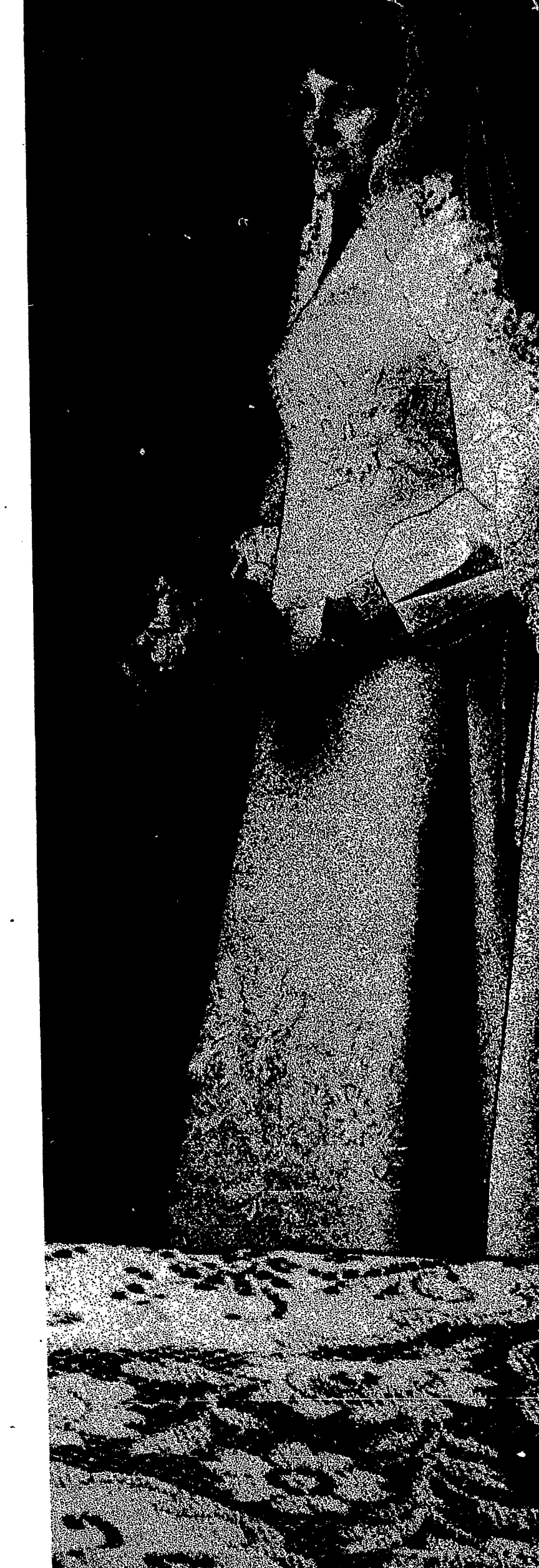
March 6, 1970 Courier-Journal 7A