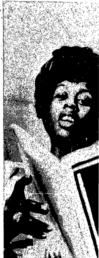
The Mormon Church policy barring Negro in its famous Mormon Yulle, both convert

EAST WATER AT BALDWIN ELMIRA, NEW YORK 1102 GRAND CENTRAL AVE. HORSEHEADS, NEW YORK MEMBER FEDERAL DEPOSIT INSURANCE CORPORATION