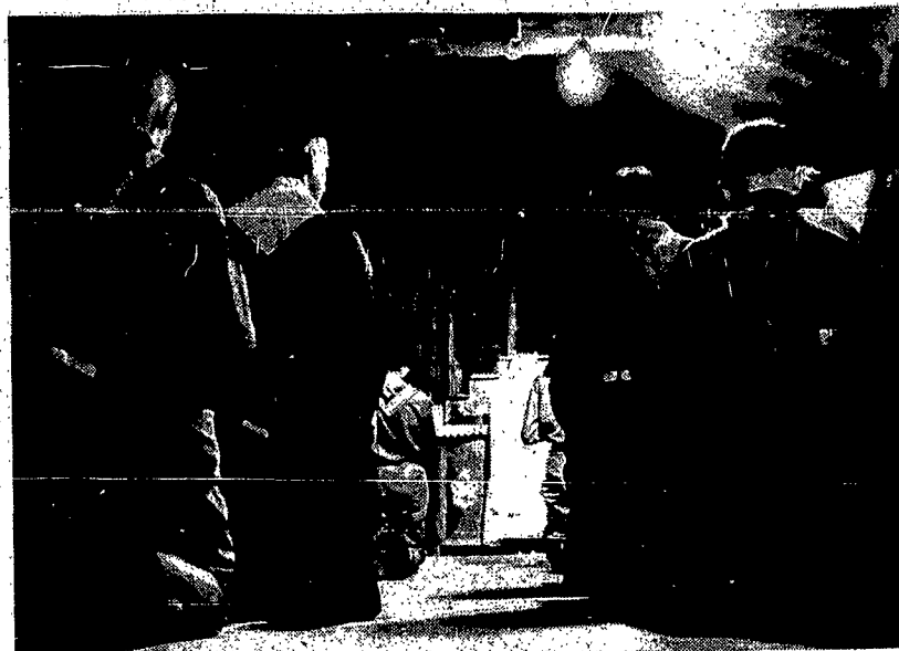
"A Scout is reverent", the 10th point of the Scout Law.

National Catholic recognition came to the Scout Movement in 1919, when the National Catholic War Council, a representative group of American Catholic hierarchy, issued a statement praising the movement and urged the establishment of scouting units throughout the country.