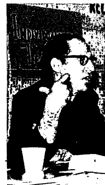
The panel at the Study Workshop