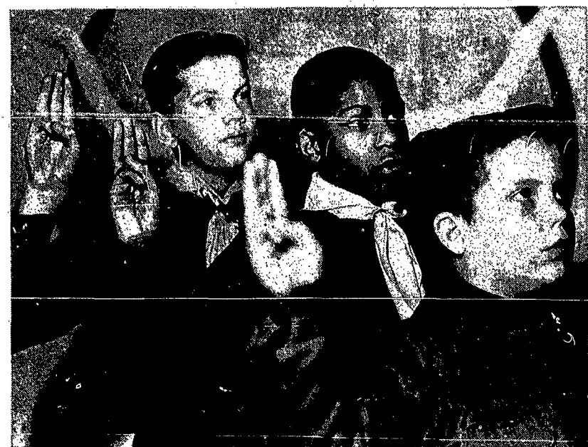
Scouts raise their hands to recite the Scout Pledge.

Today there are five emblems which may be presented