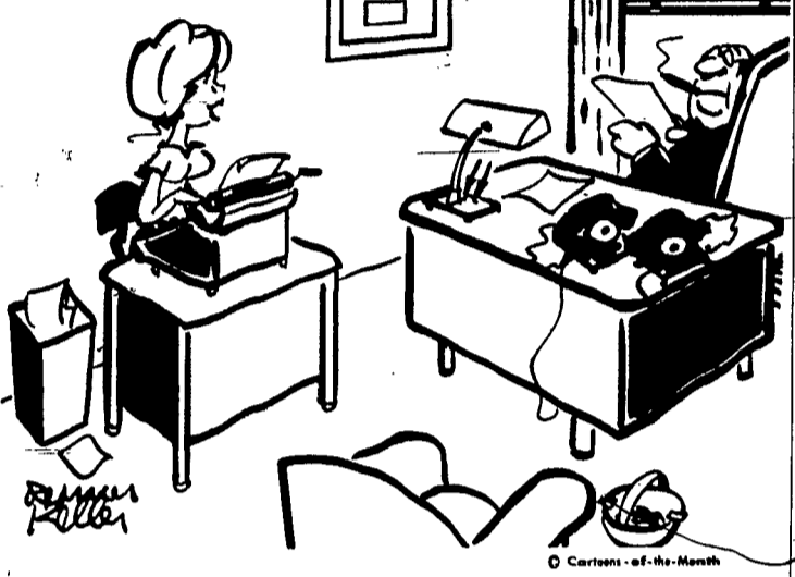
"Would you like to moonlight tonight, boss? I need a baby-sitter"

Bishop Kearney Building at St. Mary's Hospital. Members will bring gifts for the Carmelite nuns.