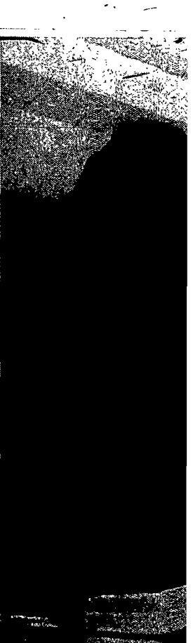
Many of the daily community who often d