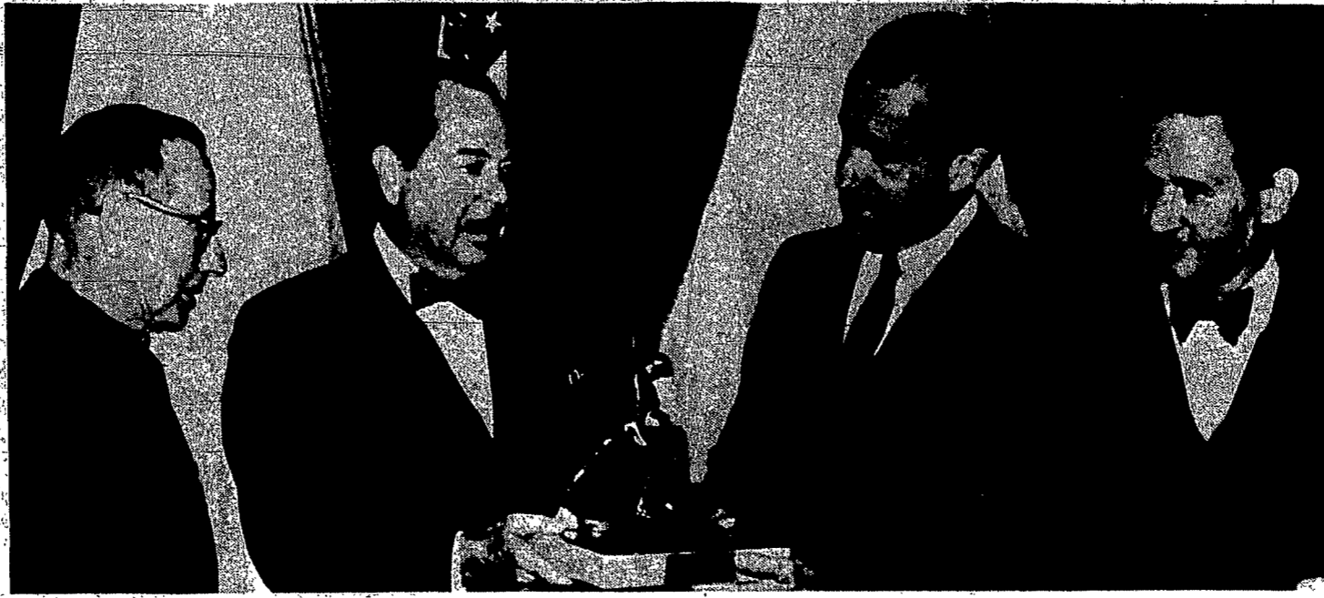
A miniature copy of the statue at the United Nations world headquarters which illustrates the passage from Isaiah 2:4 "... and they shall beat their swords into plowshares ..." is presented to President Richard M. Nixon by W. Clement Stone of Chicago, national chairman of Bible Week. The statue was given in recognition of Mr. Nixon's ser-